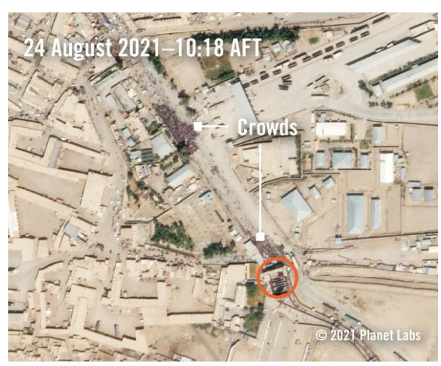
Spin Boldak-Chaman crossing. 24 August 2021.

For instance, according to UNHCR, Pakistan closed its border with Afghanistan, except for people in need of medical treatment, or with a proof of residency. Despite that, at the Spin Boldak-Chaman border crossing in Kandahar, people with Tazkira (National ID Card) from Kandahar, Helmand, Zabul, and Uruzgan were allowed to cross the border. Between 2 August 2021 and 24 August 2021, the crowds attempting to cross the border to Pakistan via the Spin Boldak crossing increased exponentially, as documented via satellite imagery (see above) and video analysed by Amnesty International.