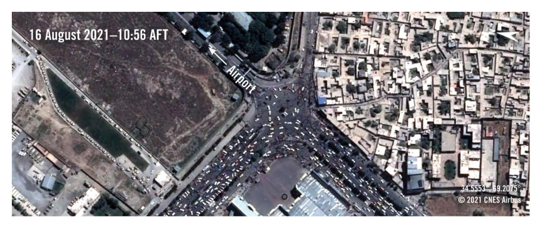
Kabul Airport vicinity. 16 August 2021.

In this report, Amnesty International, International Federation for Human Rights (FIDH) and the World Organisation against Torture (OMCT) have documented incidents of human rights violations that have taken place in Afghanistan since the takeover by the Taliban on 15 August. This report calls on the UN Human Rights Council (UNHRC) to take decisive action to establish a robust independent investigative mechanism to monitor and report on human rights abuses committed in violation of international human rights law, and to contribute to accountability for crimes under international law. Human rights defenders, journalists, and others who are targeted for their work must be evacuated and given safe passage if they wish to leave Afghanistan; and women and girls, and ethnic and religious minorities who are targeted because of their gender, ethnic, and religious identity, must be guaranteed protection. All those who wish to leave Afghanistan must be assured the right to seek asylum. At the same time, the Office of the Prosecutor of the International Criminal Court must receive assistance from the international community to immediately recommence its investigations into crimes under international law committed in Afghanistan.