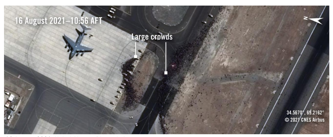
16 August 2021. Kabul Airport.

The thousands who are left behind, or are trying to leave Afghanistan, are testament to the brutal regime of the Taliban circa 2001, when extrajudicial executions abounded, and women and girls were oppressed with a plethora of restrictions. Since then, even in the last 20 years, the Taliban and other armed groups have conducted brutal attacks on civilians, journalists, human rights defenders, and government workers, resulting in Afghanistan having one of the highest civilian deaths in the world. Nearly 50,000 civilians have died in the last 20 years. The first half of 2021 alone recorded 5183 civilian casualties (1,659 deaths and 3,524 injuries), of which 32 per cent were children. This is a 47 per cent increase in civilian casualties compared to the same period in 2020. Those responsible for these casualties include both anti-government and pro-government forces.