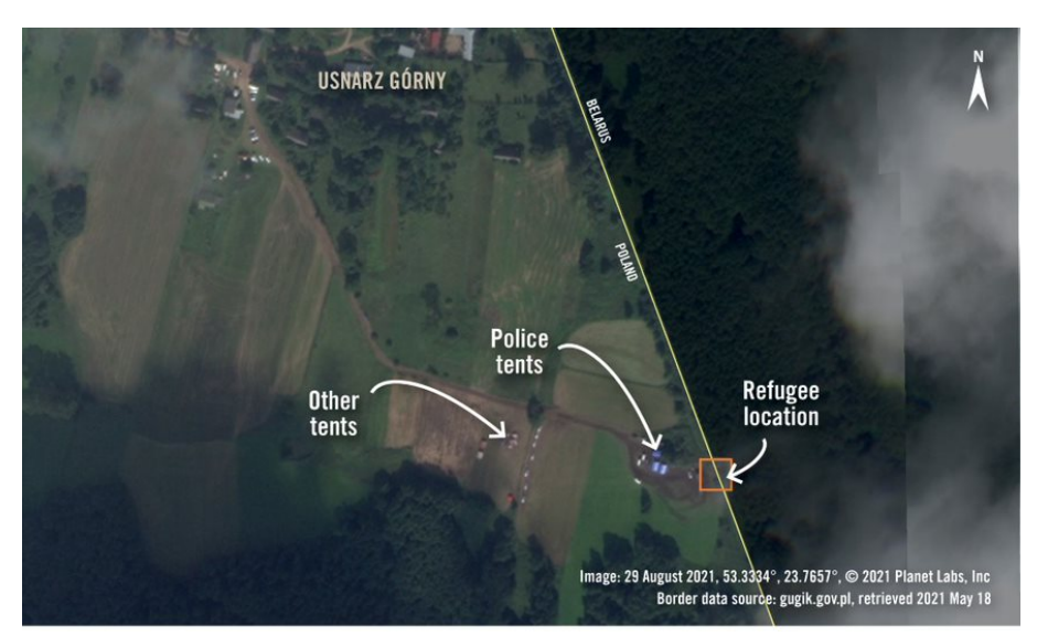
Poland-Belarus Border. 29 August 2021.