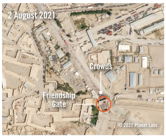
Spin Boldak border crossing. 2 August 2021.

Afghans who tried to cross land borders, an Afghan researcher, and the UN agency in charge of refugees (UNHCR), all told Amnesty International that the Afghan people were also prevented from seeking refuge abroad because most of the land border crossings were closed for asylum seekers. 185