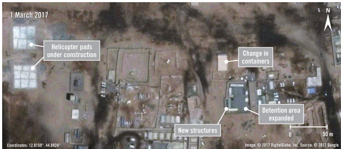
On 1 March 2017, imagery shows the area has been expanded and three new structures are visible. The color and configuration of the containers outside the perimeter has changed, suggesting they were updated or they are new containers. Two new helicopter pads are also under construction.