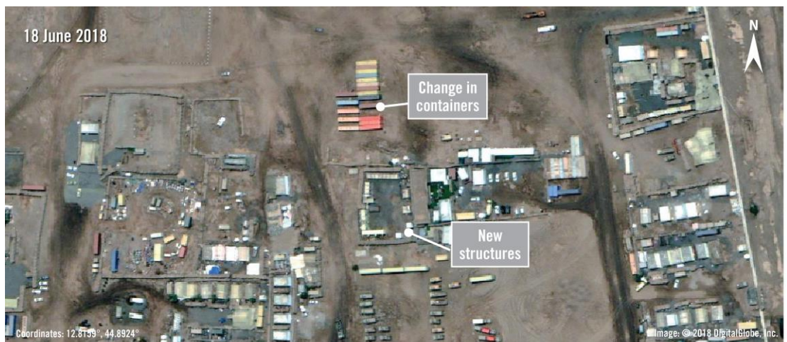
On 18 June 2018, imagery shows a change in the containers and a cluster of new small structures compared to the imagery from March 2017, which would indicate that the facility is likely still being maintained and in use.