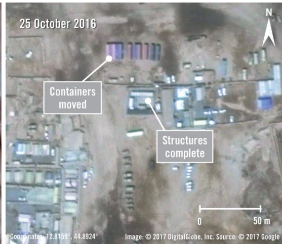
On 15 May 2016, construction of three buildings is visible. Walls of 12 individual rooms with an approximate area of 5m 2 each are apparent. On 25 October 2016, the structures appear complete and containers have been moved nearby, suggesting possible connection with the detention area.