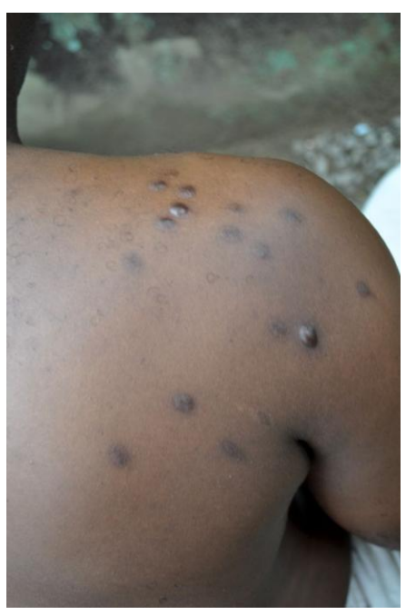
Burns from melted plastic on the bodies of former detainees in Abidjan.

The systematization of detention in unrecognized places of detention and incommunicado detention has facilitated the use of torture and other ill-treatment. A very large number of prisoners and former prisoners interviewed by Amnesty International described in detail the torture which they suffered and their coherent narratives show that these practices are essentially used to extract "confessions" but also to punish and humiliate individuals regarded as supporters of former President Gbagbo.