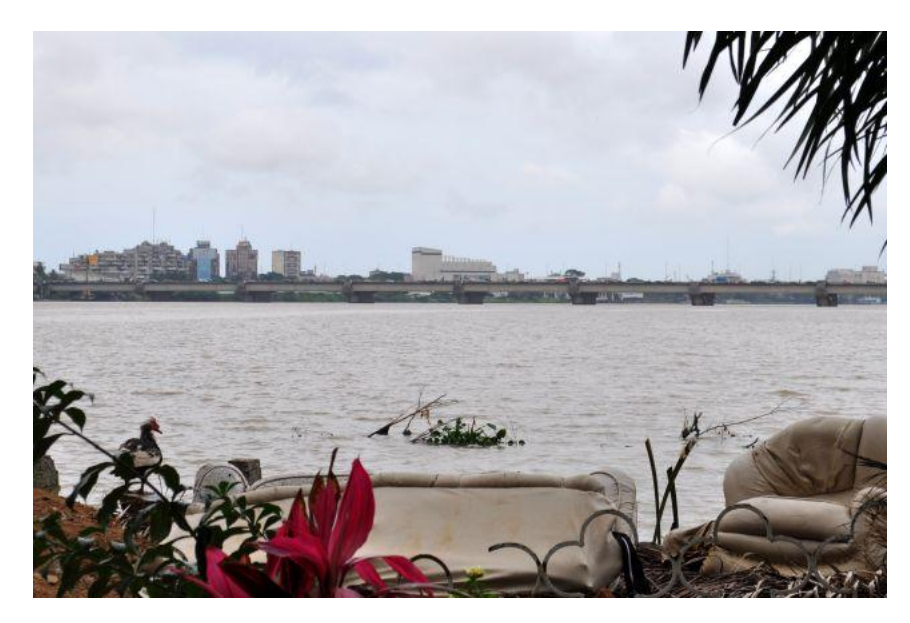
Lagoon where Djeboh Ephrem Romaric's body was found.