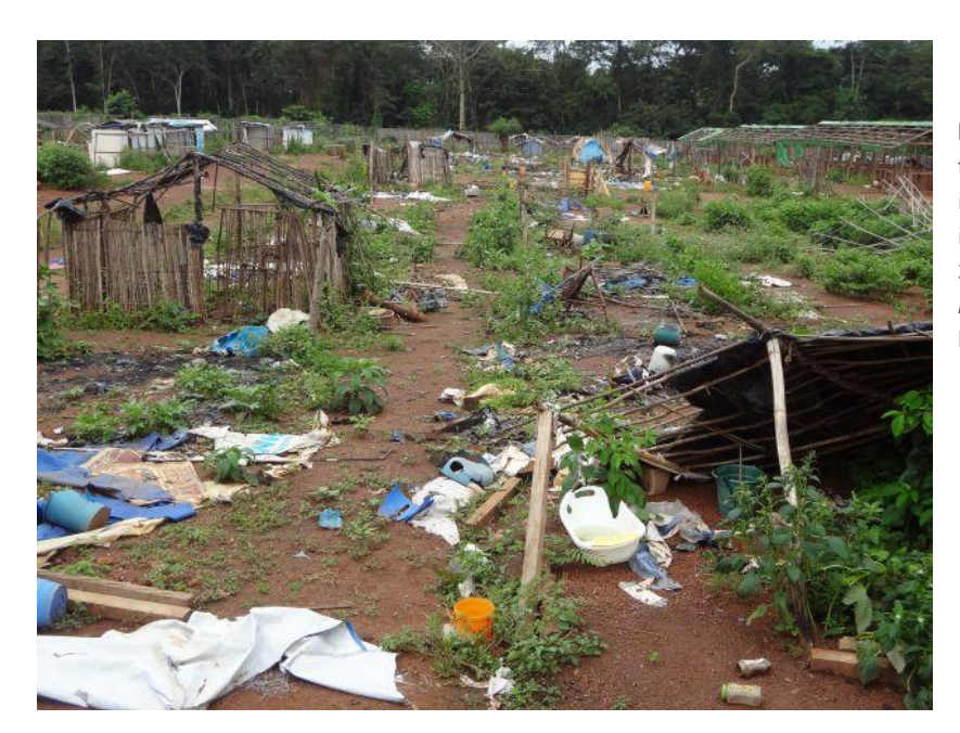
Nahibly Camp two months after its destruction, in September 2012.