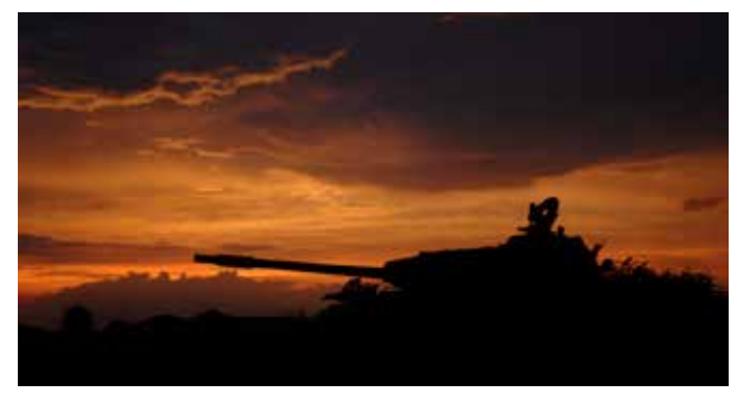
Cover photo: Military tank in Upper Nile state, South Sudan, 2009.

Index: AFR 65/3203/2016 Original language: English Printed by Amnesty International, International Secretariat, UK