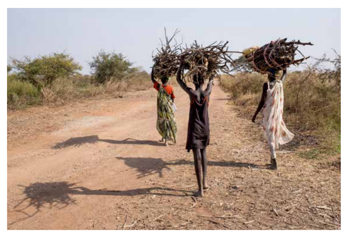
Women returning with collected firewood to the UNMISS PoC site in Bentiu, January 2015.

Nyawal was treated for her rape by Médecins Sans Frontières (MSF) and also received support from the International Rescue Committee (IRC), which provides counselling for survivors of sexual violence in the Bentiu PoC. Her experience caused her significant mental anguish.