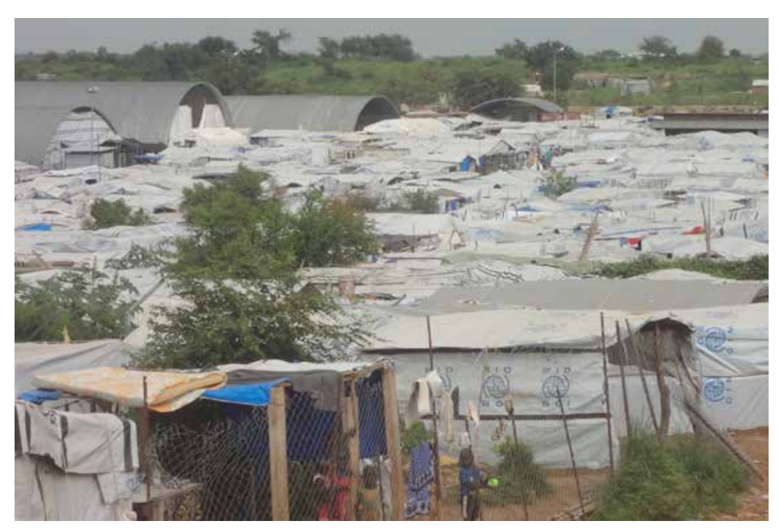
UNMISS PoC site in Juba, South Sudan. 2014

I tried to go to school here but found that I could not concentrate even on the easy things. They just opened a school here, but my thoughts distract me. When I sit still, my mind just goes to other things like my children."