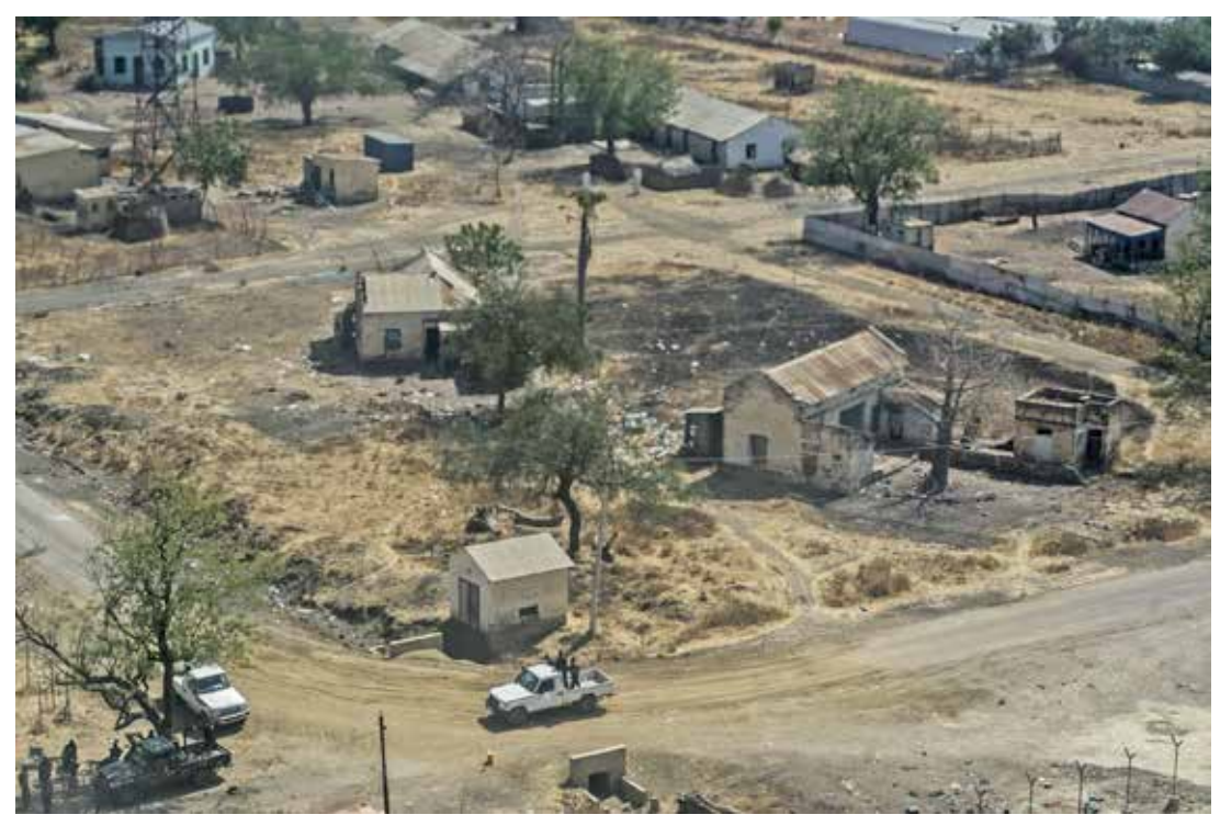
A view of the deserted streets in Malakal, Upper Nile state in January 2014 after residents fled violence between government and opposition forces.

Ajak fled to the Malakal UNMISS base on 25 December 2013, during the first attack on Malakal by opposition forces.