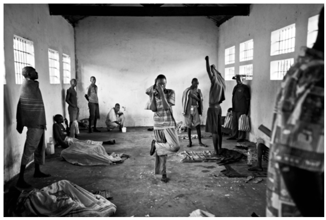
People with suspected mental conditions are routinely detained in prisons. Juba Central Prison, Juba, South Sudan, 2011.

The routine use of prisons to house individuals with mental health conditions is a stark manifestation of the inadequacy of mental health treatment, stigma about mental disorders and the deficit of facilities and trained staff. Individuals with mental health conditions deemed to pose a danger to themselves or others often end up arbitrarily detained in prison, even if they have not committed any crime. They may be transferred to prison from medical facilities or taken directly to prison by family members who feel unable to care for them. In May 2016, there were 66 male and 16 female inmates in Juba Central Prison categorized as mentally ill, more than half of whom had no criminal files.<sup>92</sup> According to a former health worker at Malakal Hospital, prior to the conflict, there were 27 people with mental health problems in the Malakal prison. "Some were brought to prison by family members because they were violent, aggressive, and suicidal," he explained.<sup>93</sup>