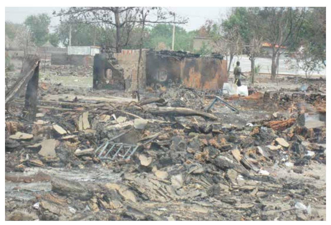
The conflict resulted in the destruction of homes, hospitals, and other buildings. Bentiu, South Sudan, March 2014.

In December 2013, growing political tension between President Salva Kiir and Dr Riek Machar mushroomed into a brutal internal armed conflict.<sup>4</sup> Fighting started in Juba, the capital, where government forces engaged in targeted killings, primarily of Nuer men. Security forces across the country split—with some maintaining allegiance to the government and others defecting to support the armed opposition under Machar, which came to be known as the Sudan People's Liberation Movement/ Army-In Opposition (SPLM/A-IO). By the end of 2013, the conflict had engulfed parts of Jonglei, Unity, and Upper Nile states.<sup>5</sup>