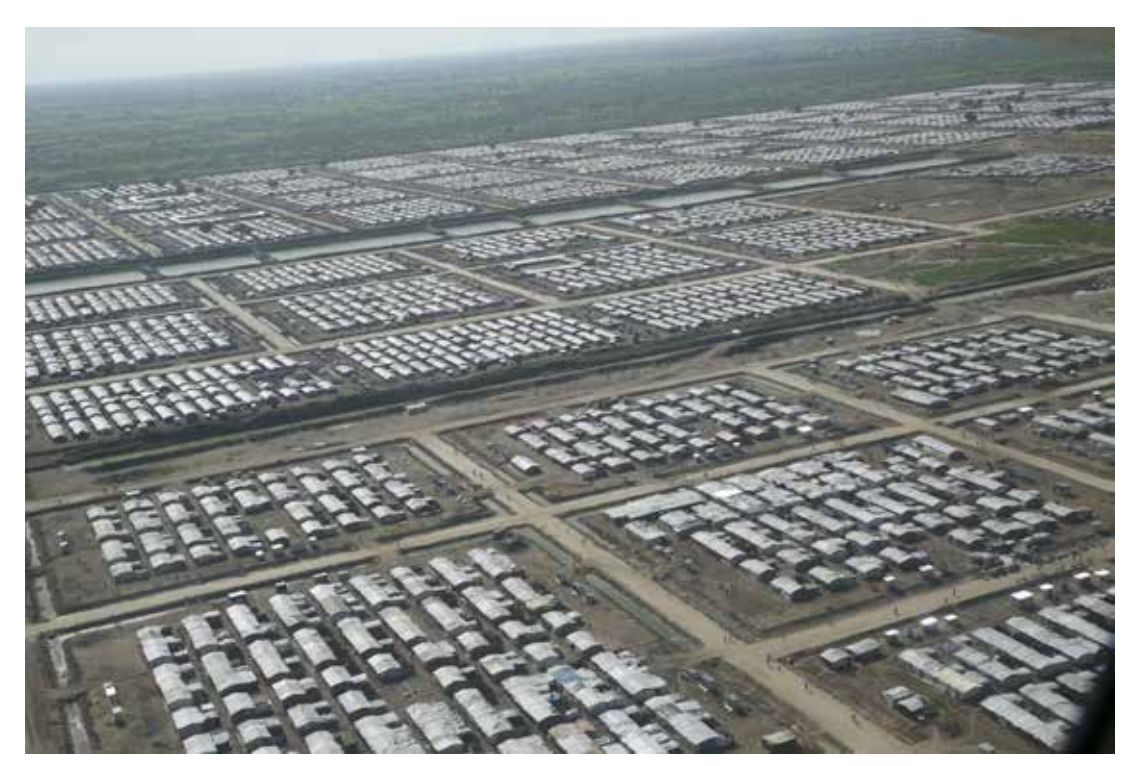
Aerial view of the UNMISS PoC site in Bentiu. June 2016.

Nyawal sought refuge in the Bentiu PoC site in early 2015, escaping an attack on her village in Guit county. She was raped by an SPLA soldier a few months after arriving at the PoC site when she ventured out to buy medicine.