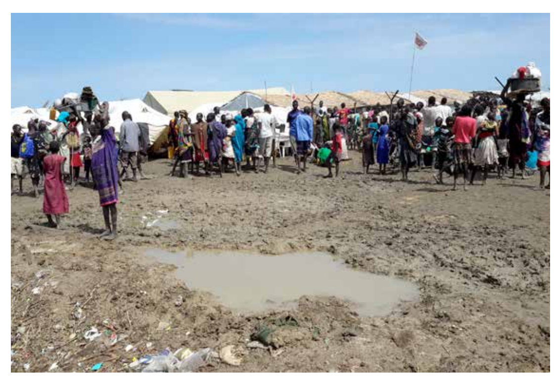
Newly arrived internally displaced people register at UNMISS PoC site in Bentiu, Unity state, May 2015.