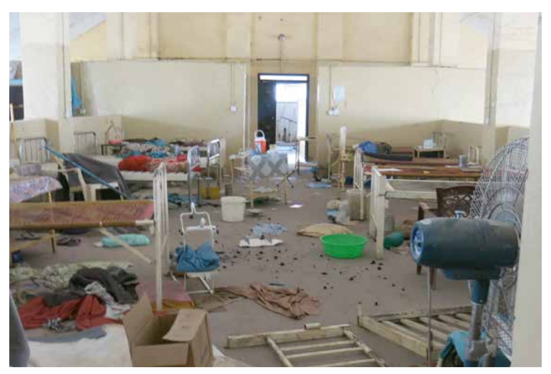
A ward in Malakal Teaching Hospital, where patients and displaced people who had taken refuge were killed by opposition forces in late February 2014. Malakal, Upper Nile state, March 2014.

"She can't manage—she's not normal. She can talk but it's senseless. She quarrels with the children. She cooks, but like a child, she burns things. She knows the children's names, but she does not know their ages. It is the children who tell her to do the things she should do. She can't identify what is happening...Sometimes I pray to God to help her."51