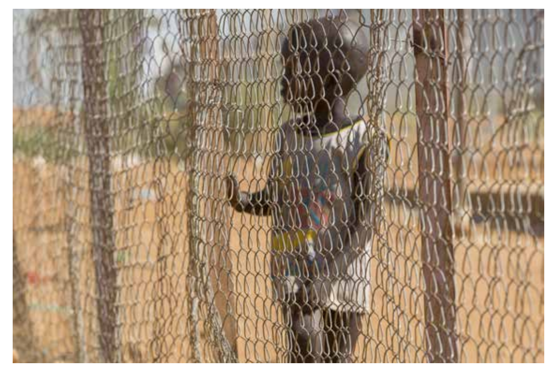
A child at the UNMISS PoC in Juba. 2015

"I am unable to sleep. My wife appears in my dreams. Sometimes she blames me for not performing the required funeral rites...I didn't go to church; I blamed God. When I would go to church I would just cry. My wife used to sing in church. I would remember her voice, how she used to sing."