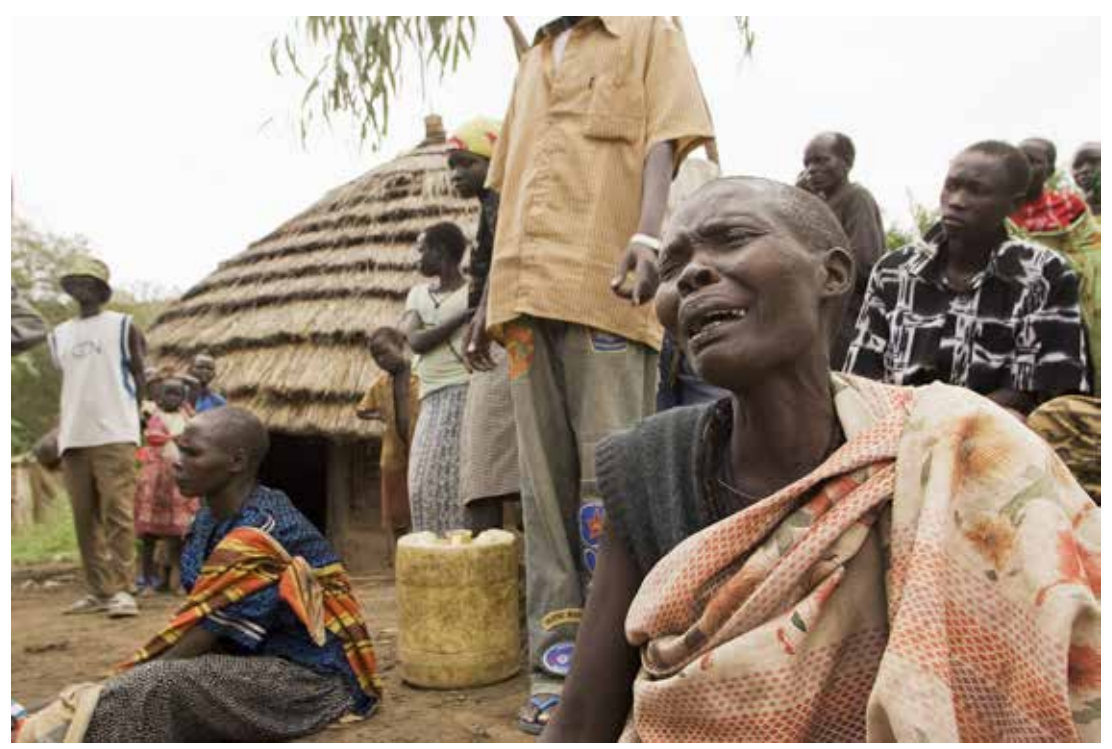
A woman cries following a deadly attack by cattle raiders. Chukudum, Eastern Equatoria state, 2007

The armed conflict that erupted in December 2013 is only the most recent episode of violence in South Sudan's history. From 1956 to 1972 and again from 1983 to 2005, the Government of Sudan and pro-government militias fought against armed groups who sought greater equality and autonomy for the southern regions of Sudan. Both periods of civil war were characterised by extreme violence against civilians, gross human rights abuses, and massive forced displacement. During the second civil war from 1983 to 2005, an estimated 1.9 million people—one out of every five southern Sudanese—were killed or died from disease and famine, and some four million people were internally displaced.<sup>2</sup>