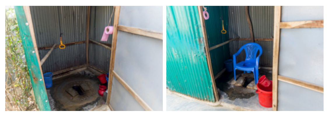
Latrines with a rope handle and plastic latrine chair, Camp #18 Age Friendly Space, Bangladesh, 23 February 2019