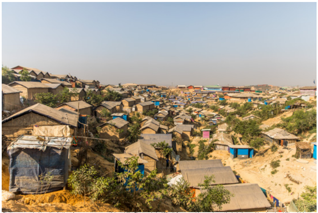
Shelters are packed together in the refugee camps, up and down hills. The terrain is difficult for some older people, particularly those with reduced mobility, which brings challenges for accessing latrines, distribution sites, and health facilities, Bangladesh, 20 February 2019.