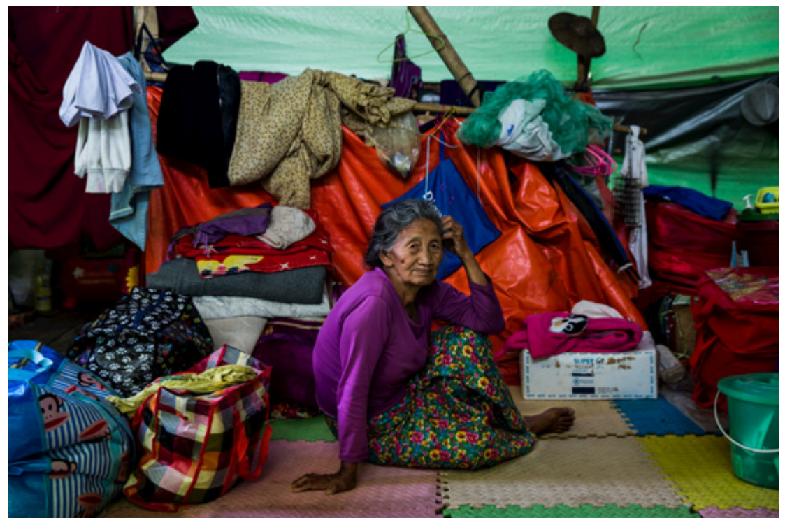
An older ethnic Kachin woman sits in her shelter in Jaw Masat IDP Camp, Myitkyina Township, Kachin State, 10 December 2018