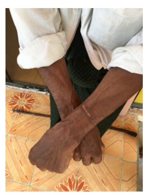
A 67-year-old ethnic Rakhine man shows a scar from when Myanmar soldiers bound his wrists with rope and tied him to a wooden pole for hours, 30 March 2019.

"When I got to where the captain was, the soldiers tied my hands... behind my back, with the rope that's used for cattle. I was tied to a wooden pole at the base of a house. They asked