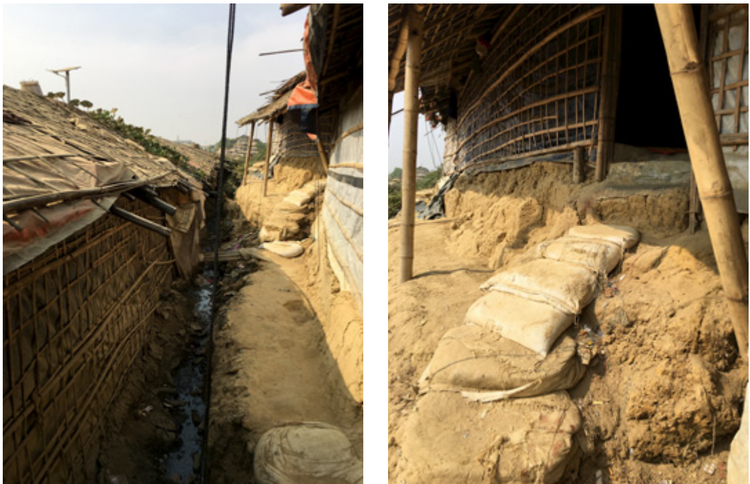
The path leading to the shelter of the 90-year-old man in Camp #11, Bangladesh, 16 February 2019

The man, who had been a farmer in Myanmar, said he tries to walk to the latrine when possible, but "if I can't make it there, I go inside the house... I have no choice."199 He said he pays someone to come a few times a week to throw out the waste and clean the pan he uses inside the shelter, giving the person 1,000 taka (US$12) every two months—stretching his and his wife's already limited resources.<sup>200</sup>