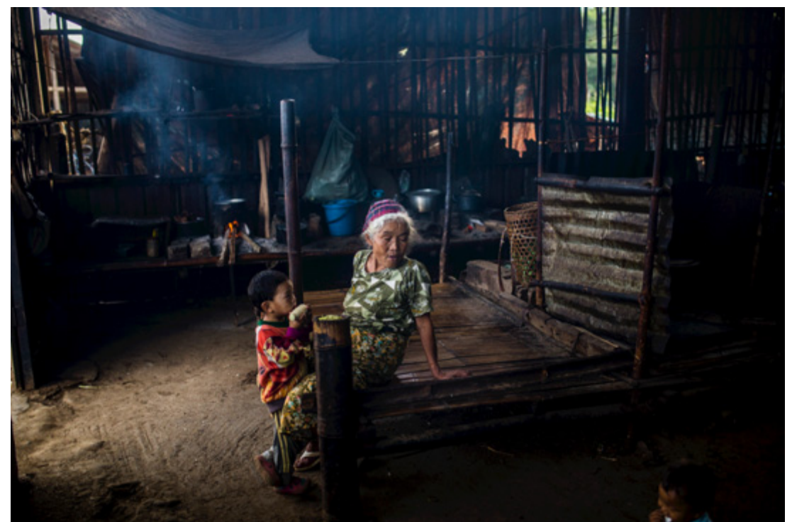
An older ethnic Kachin woman and her grandchild pass the time in a common cooking facility for IDPs at the Kutkai Downtown (KBC Church) IDP Camp in Kutkai, northern Shan State, Myanmar, 28 July 2017.

Neither the creation of a new sub-committee or group on older people's rights, nor the systematic inclusion of one or more older people on a camp committee, will, on its own, address the issues outlined in this chapter or in the preceding chapter on the Bangladesh refugee camps. But it will better ensure that campin-charge officials like the one from Myitkyina Township cited above hear older people's voices and their ideas for responding to their specific needs. It will also, as importantly, see and treat older people as resources and essential participants in the decisions being made for everyone living in the camps.