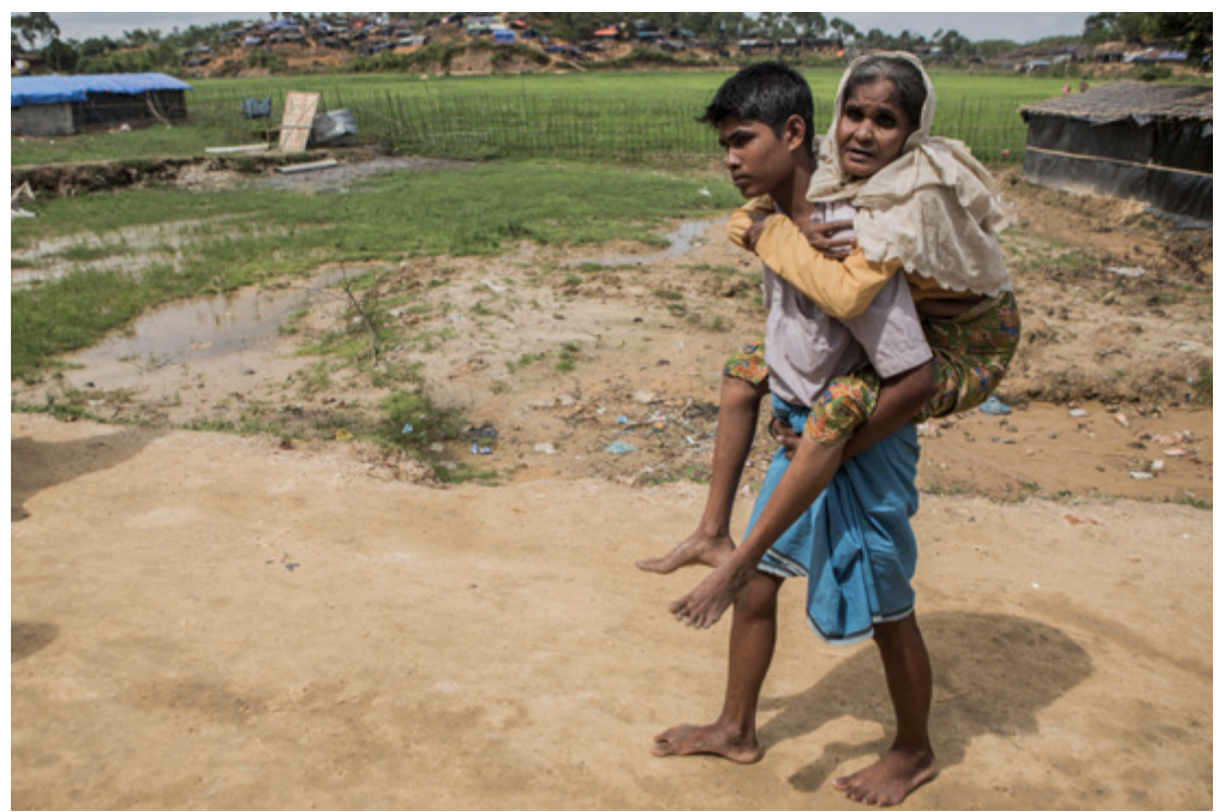
A boy carries an older Rohingya woman in the refugee camps in Bangladesh, 28 September 2017.

He had not heard news of his grandfather in the 18 months since, but assumed he died there on the path. "Sometimes my relatives here, they ask me, 'How could you leave behind your grandfather?"" the grandson recalled, tearfully. He said he had seen around ten other older people who were left behind along the path, huddled in blankets similar to what was used to transport his grandfather.88